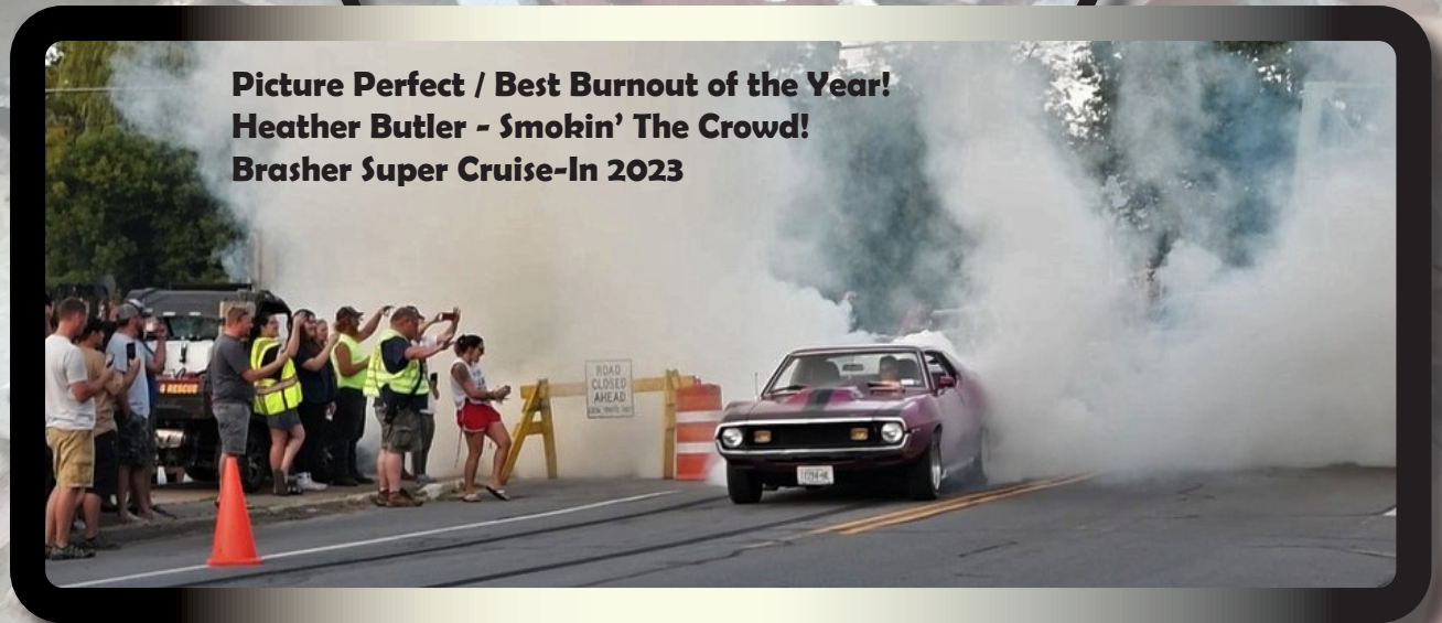
Picture Perfect / Best Burnout of the Year! Heather Butler - Smokin' The Crowd! Brasher Super Cruise-In 2023